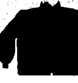
QUILTED JACKET CONFIGURATION