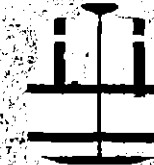
QUILTED JACKET CONFIGURATION