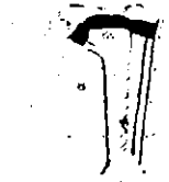
QUILTED JACKET CONFIGURATION